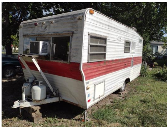
1972 EXCEL CAMPER aka CLAMPER Made in Smith Center, Kansas

ITEMS FOR AUCTION INCLUDE: Abe Lincoln Photo, Antique Furniture, B.B. Guns, Barn Doors, Battery Chargers, Belt Sander, Bethlehem Photo, Bicycles, Bird Baths, Bird Cage on Stand, Book Shelves, Bugle, Cameras, Car Tags, Cast Iron Benches, Cast Iron Cooking Pots, Cast Iron Sink, Chicken Feeders & Water, Clamps, Claw Foot Tub, Coleman Lanterns, Coleman Stove, Collectible Tins, Cookbooks, Cookware, Copper Kettles, Corelle Ware, Deep Freezer Chest, Depression Glassware, Dog Crate, Dressers, Drill Press, Drills, Fainting Couch, Fishing Poles, Flour Sacks, Galvanized Tubs & Buckets, Gas Outdoor Cooktop, Generator, Glass Chess Set, Grandfather Clock, Grinders, Ice Cream Makers, Ice Tongs, Ladders, Lanterns (All Shapes & Sizes), Lunch Boxes, Match Holders, Metal Bed Frames, Metal Décor, Metal Toys, Metal Yard Chairs, Microscopes, Military Items, Milk Can, Mowers, Oak Table & Chairs, Oils Cans, Old Mill Photo, Pepsi Crate, Pie Cabinet, Porcelain Coffee Pots, Porcelain Stoves, Porcelain Table Top, Porcelain Wash Tub, Radial Arm Saw, Radio Flyer Wagons, Range Top Stove, Red Wing Crock (30 Gallon), Rocking Chairs, Sanders, Saws, School Desk, Signs, Sleigh Bed, Sword, Table Saw, Tackle Boxes, Thermometers, Tillers, Tool Boxes, Trunks, Vintage Crates, Vintage Malt Mixer, Vintage Tools, Wagon Wheels, Wagon Wheels, Washing Machine, Wood Burning Stoves, Wood Trim, Wooden Baskets & Boxes, Wooden Benches, Wooden Wagons, Wool Blankets, Yard Carts... ...and SO MUCH, MUCH MORE!